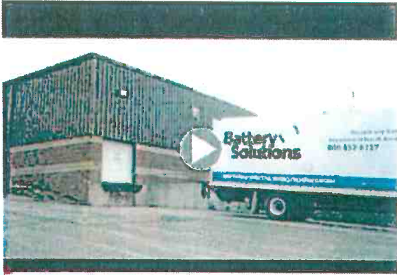
Watch this short video on battery recycling.

231-941-5555 | recyclesmart@grandtraverse.org | www.recyclesmart.info