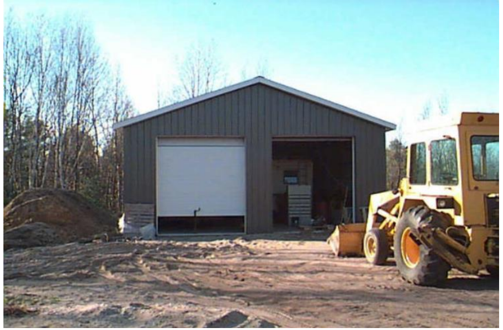
(existing pole barn on adjacent lot)