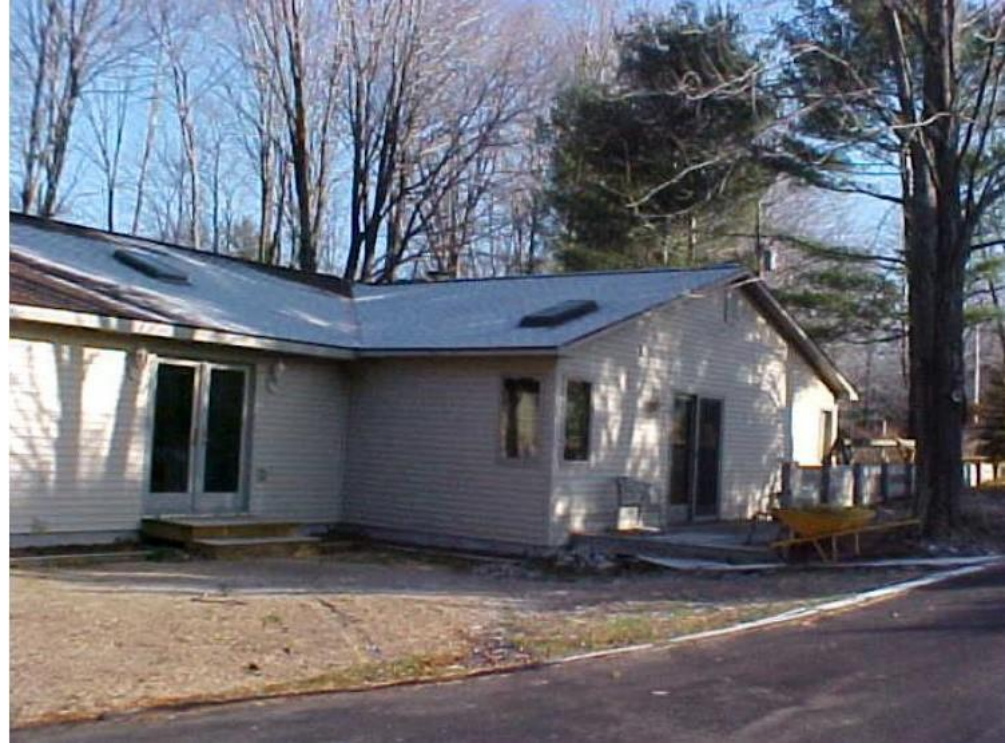
(single-family home, front view)