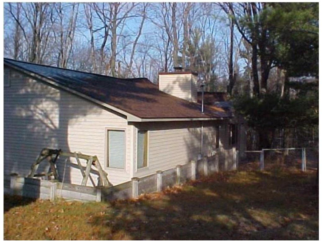
(single-family home, rear view)