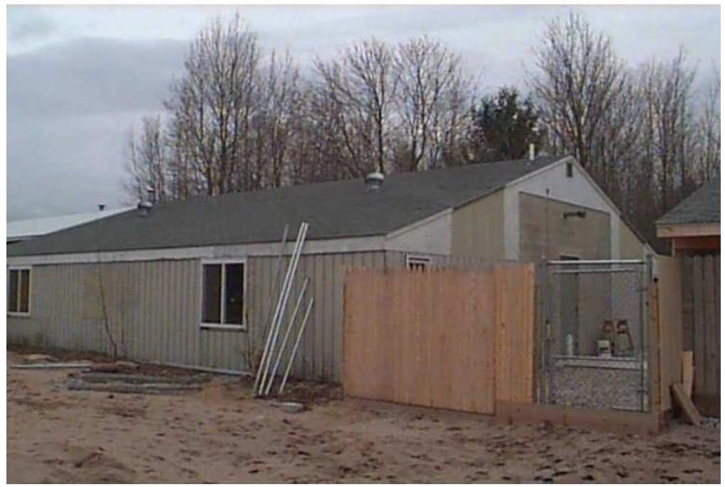
(additional kennel building)