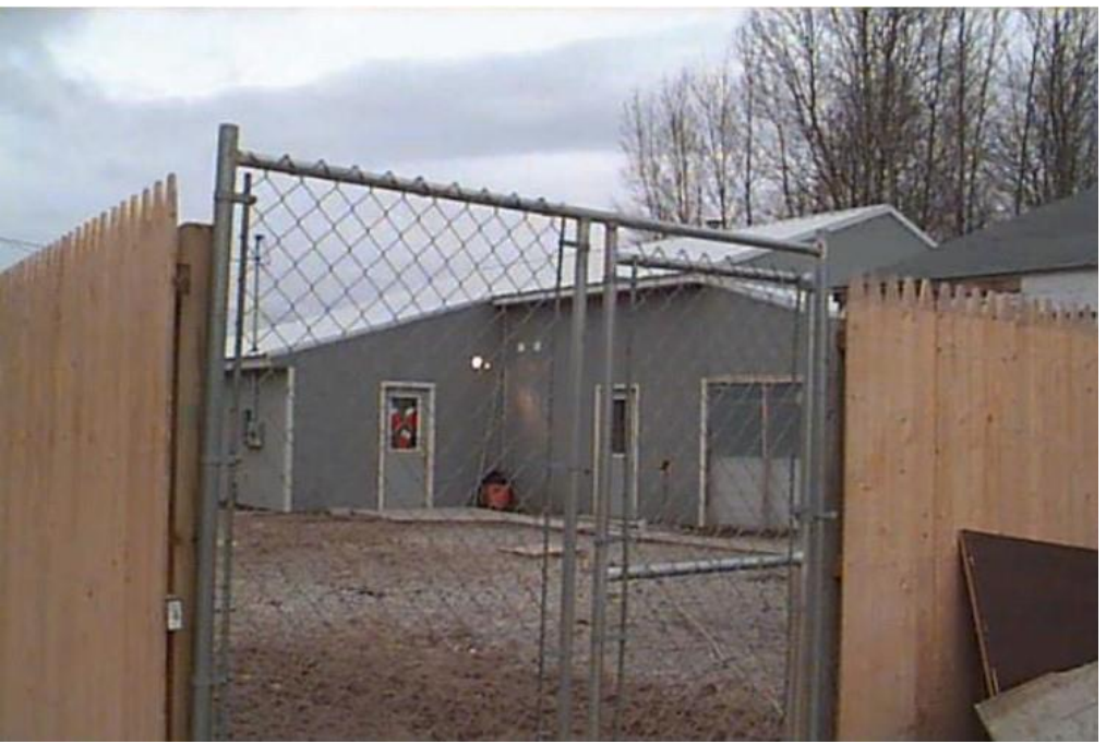
(dog run area)