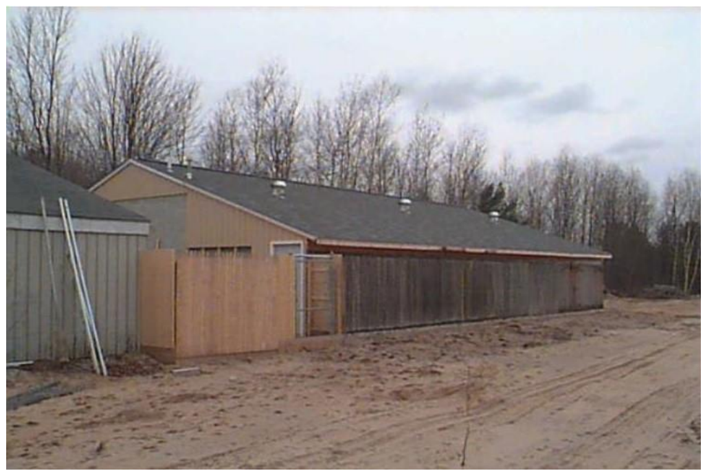
(additional kennel building)